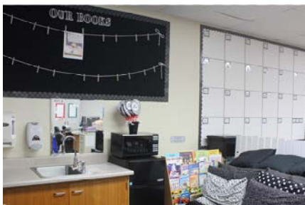
Appliances not allowed in classrooms

Many lamps designed for use in the home are not safe for use in school classrooms. Lamps and other lighting devices must meet several requirements. Lamps should be permanently mounted or used where they cannot be knocked over. To be acceptable the bulb protector and/or shade must be non-combustible. Halogen and other high-heat lamps may not be used.