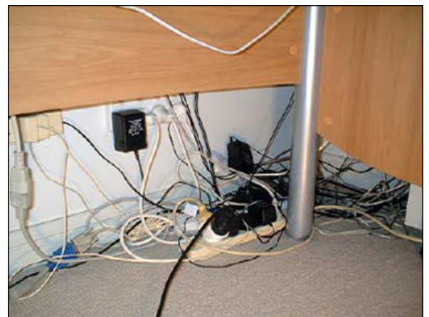
Serious electrical hazard

Extension cords may not be used as permanent wiring. These cords are intended for temporary use. They can become damaged or over-heated and lead to a fire. Of particular concern are cords run up walls and across ceilings or those located under or behind furniture. Computers, monitors, lamps and other equipment should be plugged directly into a wall outlet or into a single power bar. No outlet should supply more than one power bar. Power bars must have a circuit breaker and an on/off switch.