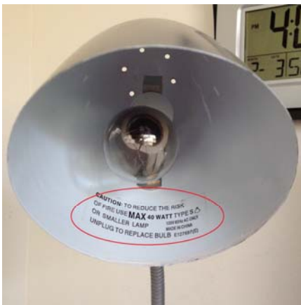
Maximum allowed wattage label