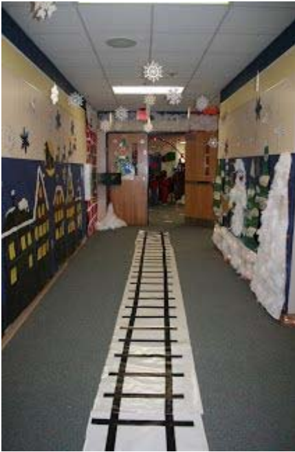
A hazardous amount of combustibles

Exit doors, fire alarm pull stations, fire extinguishers and hose cabinets must remain unobstructed and free of decorations.