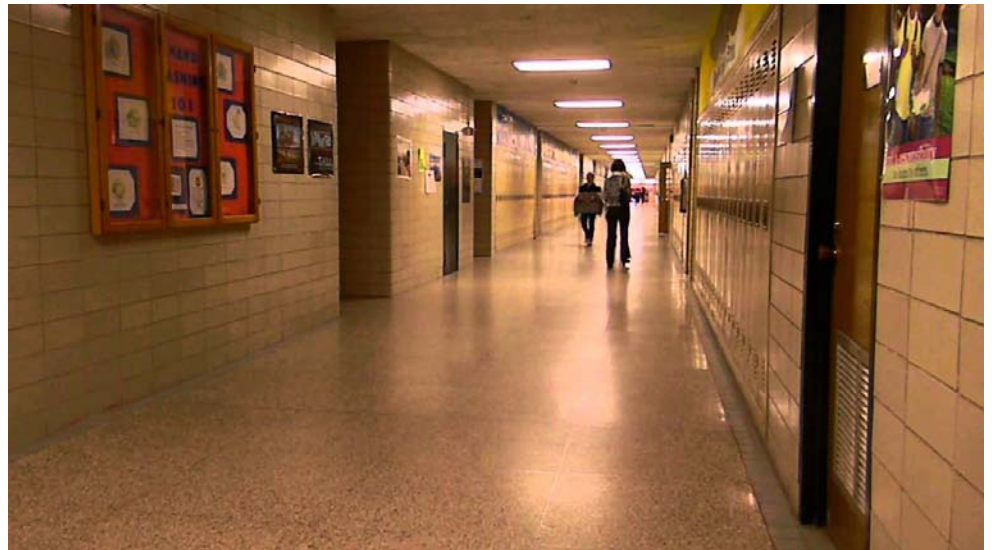
Hallway clear of obstructions and fire hazards

It is essential that hallways not be blocked by furniture, appliances or combustible materials. In no case may the width of a hallway be reduced to less than the width of the exit doors serving the hallway.