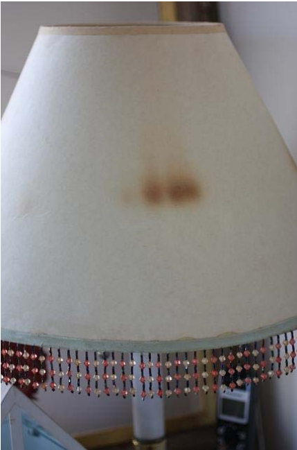
Scorched by over-wattage bulb