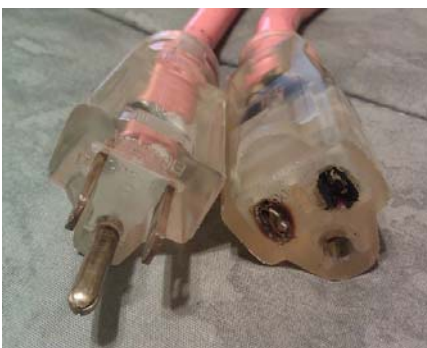
Extension cord electrical arc damage

There's only so much power to go around. Trying to draw too much electricity from an outlet will heat the wires. Problems appear where the current draw is the highest - like at a power bar or at the plugs of an extension cord. Carefully touch cords to see if they are warm. If so - unplug and reduce the load.