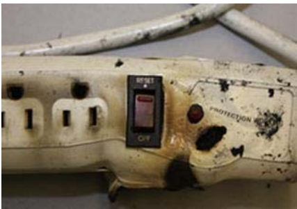
Overloaded power bar

There's only so much power to go around. Trying to draw too much electricity from an outlet will heat the wires. Problems appear where the current draw is the highest - like at a power bar or at the plugs of an extension cord. Carefully touch cords to see if they are warm. If so - unplug and reduce the load.