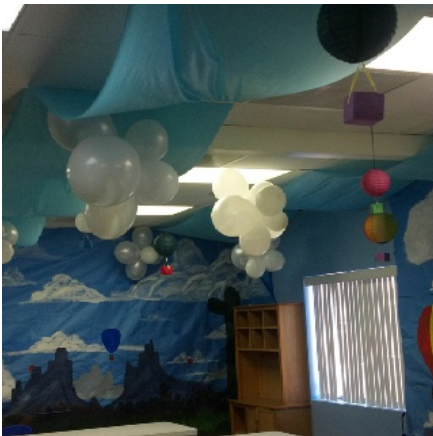
Dangerous hanging materials

Ceilings in most classrooms are made up of suspended acoustic tiles. These tiles play a role in preventing the smoke from a fire getting into hidden spaces above the ceiling. Like every other surface in a classroom the tiles must be resistant to the spread of fire. Painting ceiling tiles with water-based paint will not affect how the tile resists fire. Oil paints and other combustible finishes may not be used. Any tile removed for painting must be replaced immediately with a temporary tile. The suspended ceiling must always be complete with no holes or missing tiles.