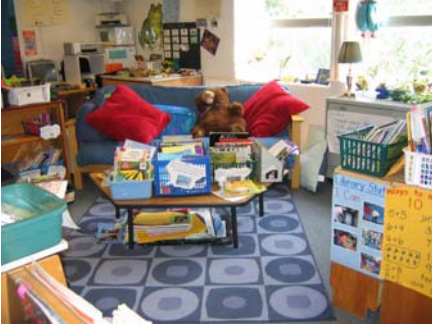
Excessive combustible fabrics